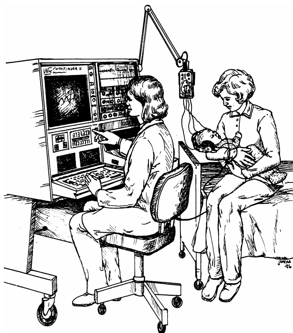
Picture 2 Having a Brainstem Auditory Evoked Response (B.A.E.R.) Test.