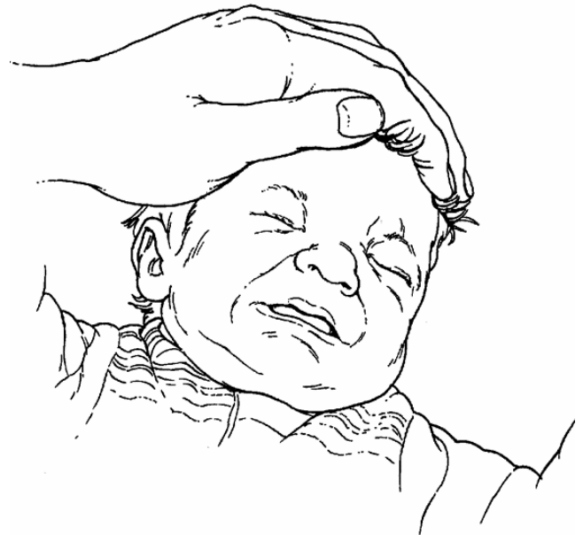
Picture 1 Gently rub the baby's head to help her fall asleep.