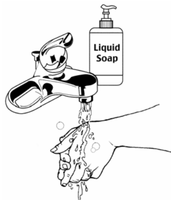
Picture 2 Wash your hands.

If you have any questions, please ask your doctor or nurse or call _____.