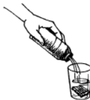
Picture 3 Pour the solution into a sterile glass or plastic container.