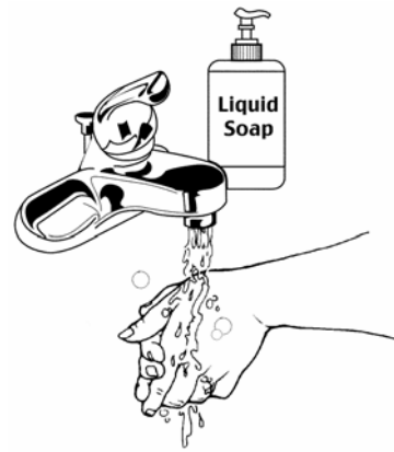
Picture 2 Wash your hands.

If you have any questions, please ask your doctor or nurse or call _____.