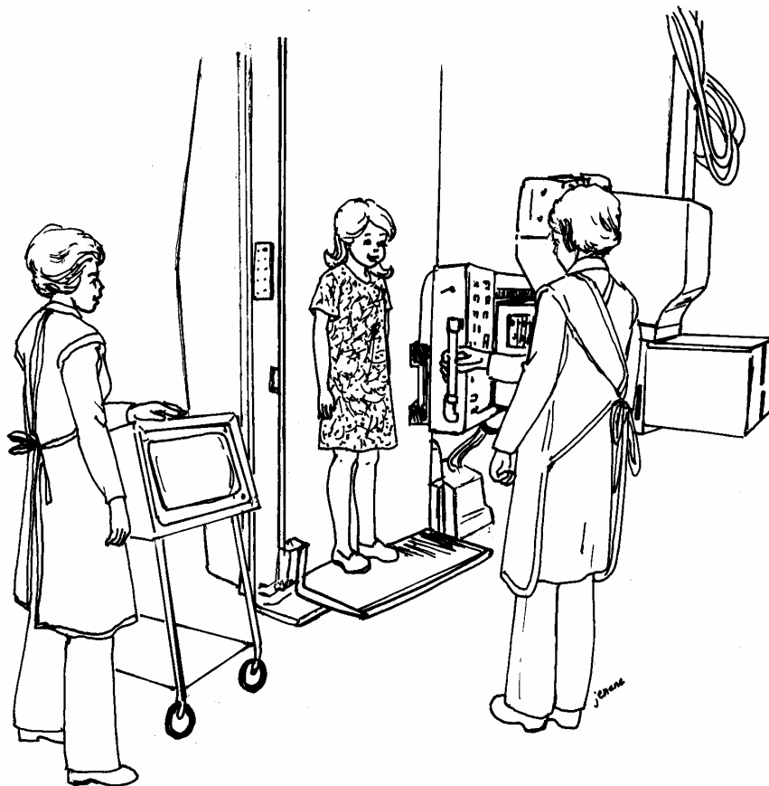
Picture 2 Having an upper GI series.