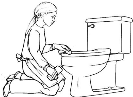
Picture 2 Clean the bathroom every day.