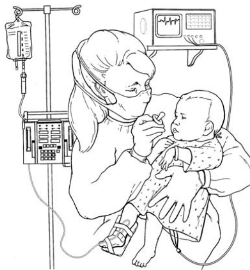
Picture 1 Keep the room lights dim and hold your child.

Your child may receive oxygen. He may need to be connected to a heart monitor or an oxygen saturation monitor. These monitors help the nurses to watch your child closely.