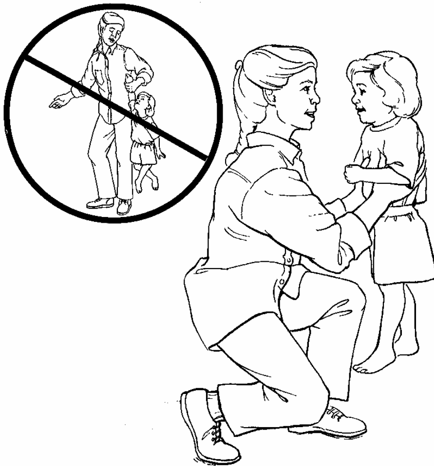
Picture 2 The right way to lift a child.

If you have any questions, be sure to ask your doctor or nurse.