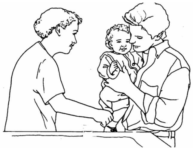
Picture 1 The doctor will examine your baby and may order some tests.