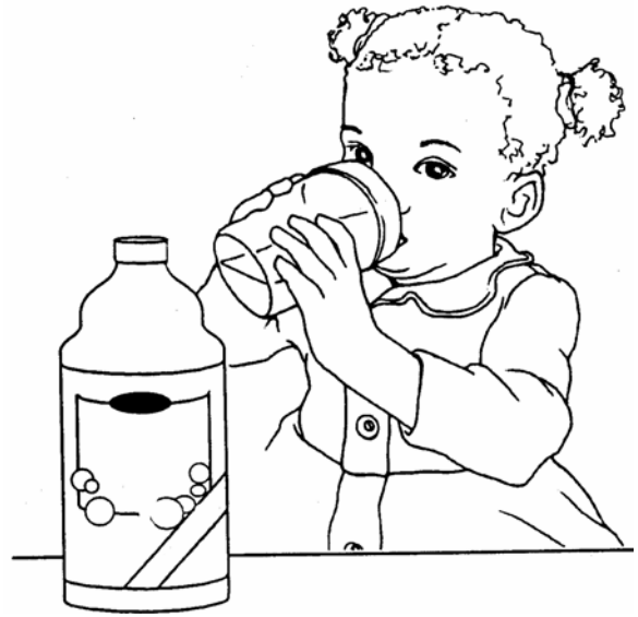
Picture 2 Give your child lots of liquids to drink.

If you need a doctor for your child, call the Children's Hospital referral and Information Line at (614) 722-KIDS.