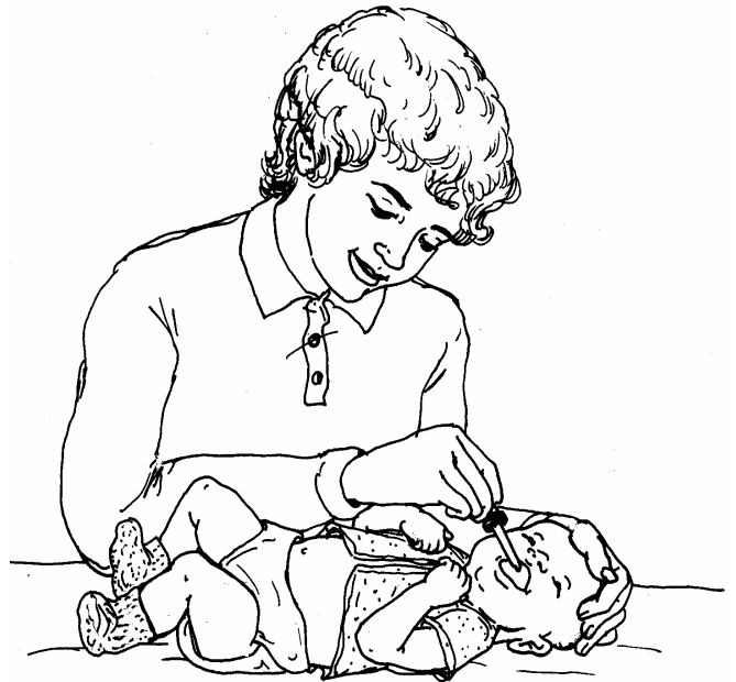
Picture 1 Slowly drop the medicine onto the white patches inside your child's mouth.