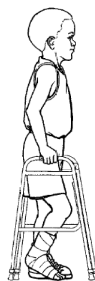
Picture 3 Push down with your arms and hop forward on the good foot to the center of the walker. Do not hop all the way forward to the front bar of the walker or you may lose your balance.